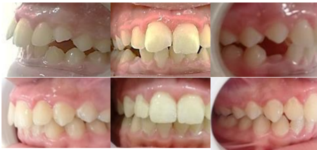
Figure 2: Clinical case treated by bite force exercises

improvement on malocclusions is spectacular (Fig 2).